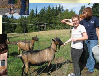
Sept '10 Farm Tour