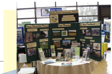
WICD display at Sound Waters

This report reflects highlights from work accomplished between July 1, 2010 and June 30, 2011 utilizing revenue from all district funding sources.