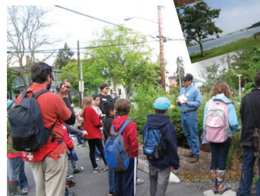
Middle School Water Quality Extravaganza