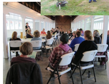
Food Safety & "Marketing Your Farm" workshop