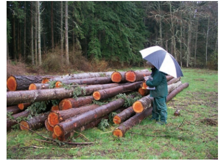
Commercial thin on managed forest