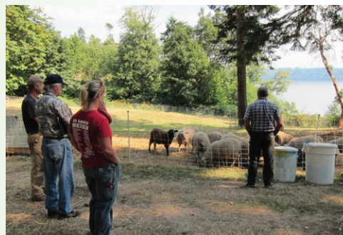
Dairy nutrient management plan completed for sheep dairy