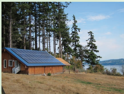
Milking facility using solar energy