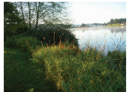
Conservation planning at Lone Lake