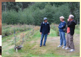
Blueberry Farm on Whidbey