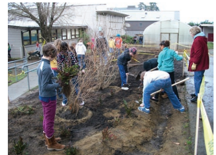
Students installing a rain garden - South Whidbey