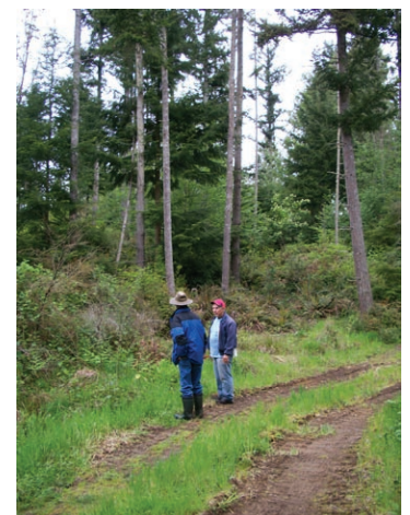
Forest conservation planning