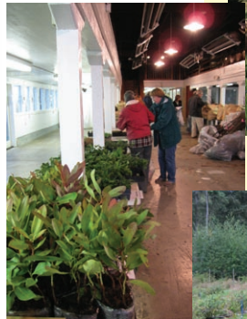
March '11 Plant Sale